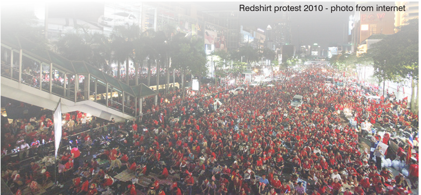
Redshirt protest 2010

ACT4DEM emerged during the bloody massacre of civilians by the Royal Thai Army in Bangkok 13-19 May 2010, with the launch of an on-line petition to 'Stop the Bloodshed in Thailand' on 16 May. Within 2 days the petition was blocked (in Thailand) by the military junta's so-called Centre for Resolution of the Emergency Situation (CRES). Nonetheless, with 9416 signatures, the petition was delivered to Ban Ki Moon via UN HQ Bangkok on 26 October 2010.